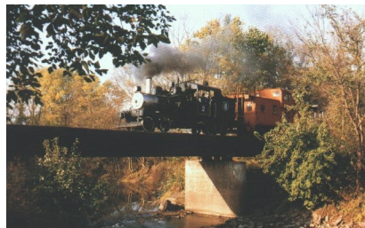
SILVER CREEK & STEPHENSON STEAM TRAIN RIDES