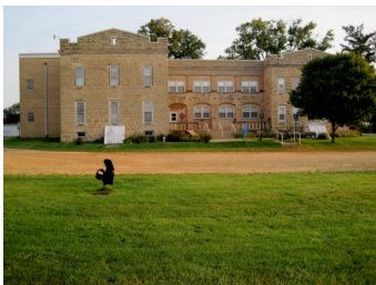
SILVER CREEK MUSEUM TOURS