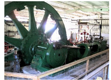
130-TON COOPER CORLISS OPERATING STEAM ENGINE